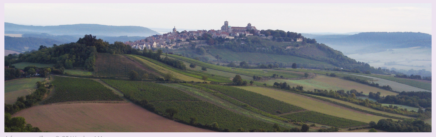
A far away village

Criterion (vi) In the 12th century, the hill of Vézelay became the focus of a surge in Mediaeval Christian spirituality, leading to the emergence of diverse and specific events, ranging from prayer and chansons de geste (epic poems) to the Crusades.